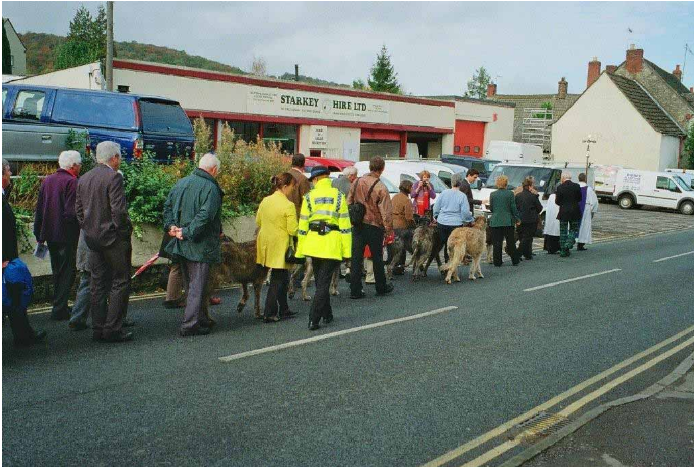
The procession from St Mark's Church on its way to St James Church, Dursley 23/10/09