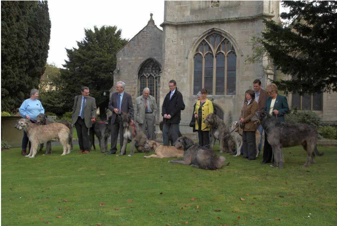
All the dogs present on the day pose on the grass in front of St James Church 23/10/09