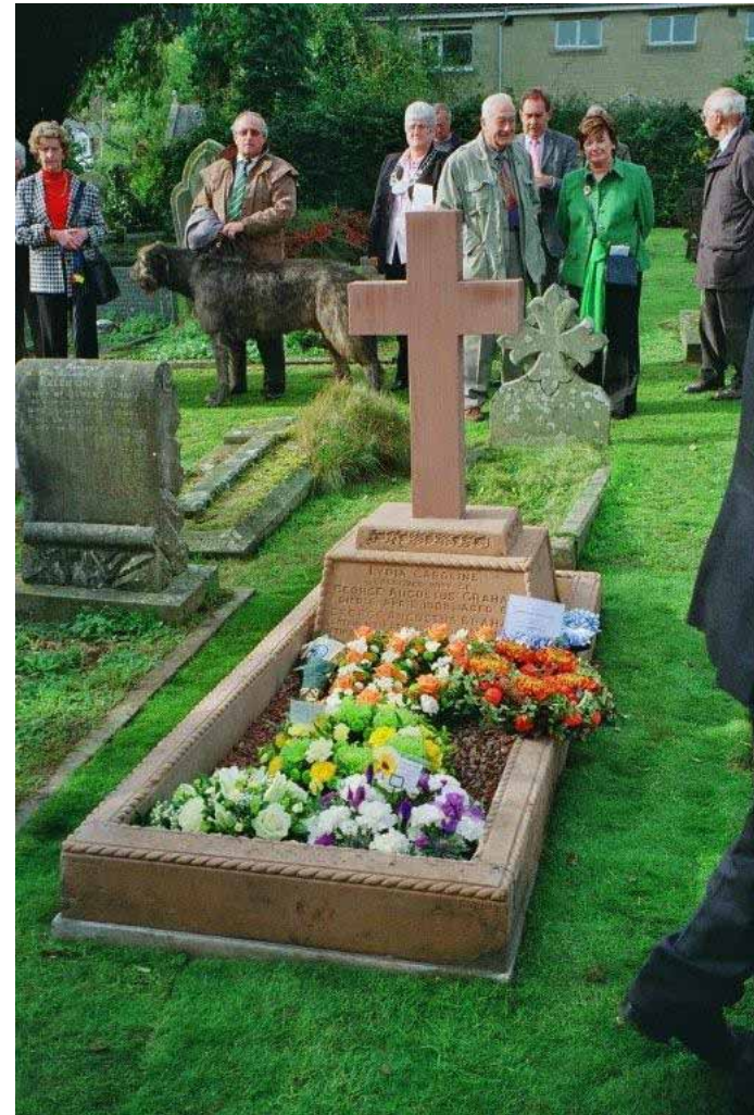
The restored grave bedecked with wreaths and flowers 23/10/09