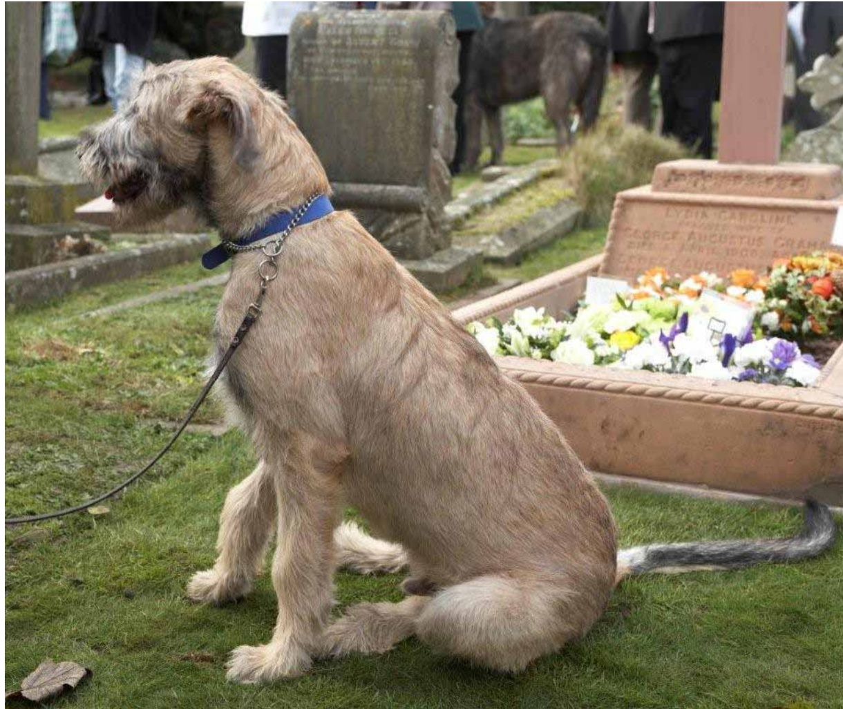
The youngest Irish Wolfhound present sits at the foot of the grave 23/10/09